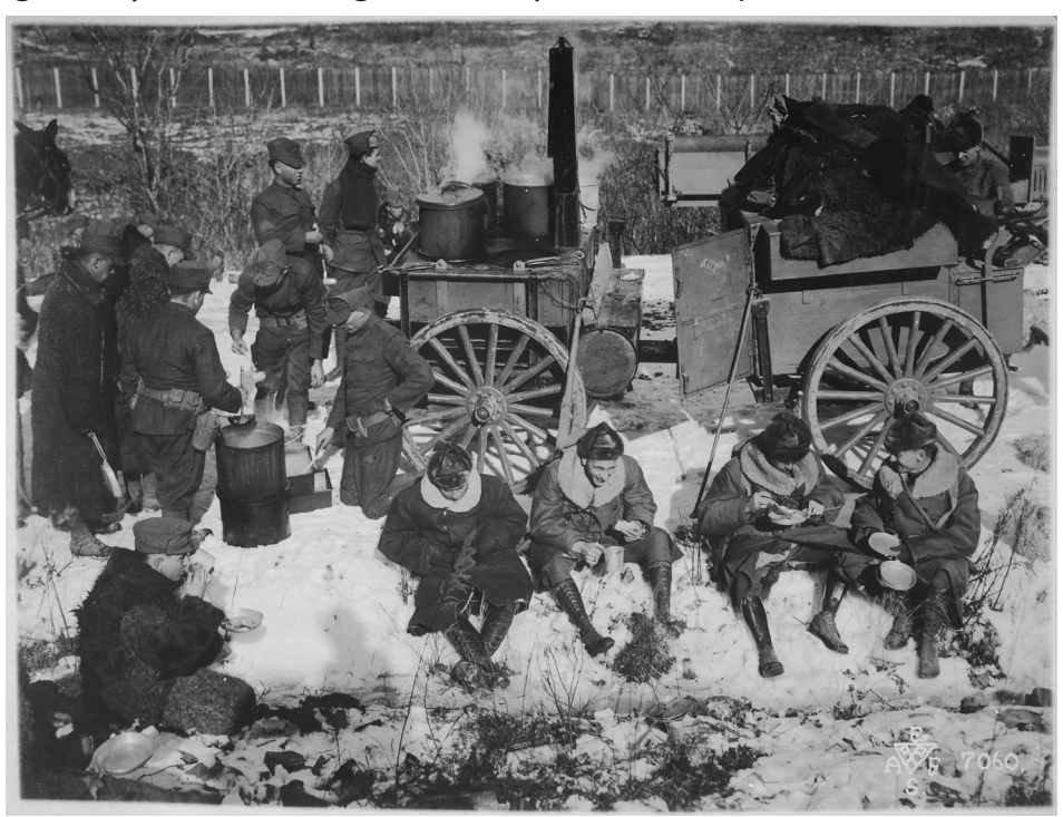
31st Infantry on practice hike. Officers of Company "A" at mess..., December 3, 1918.

This photograph shows officers of Company A using rolling kitchens on a practice hike during World War I. Use the image and your knowledge of history to answer questions below.