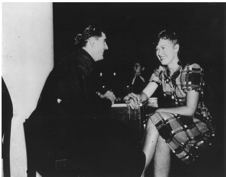
Guy meets gal: A Texan Marine throws 'a mean line' to a New Zealand helper at the Allied Services Club in Wellington