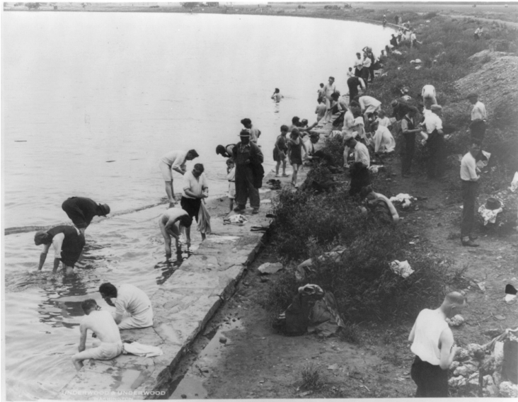
Top Left: Bonus Army stages huge demonstration at empty Capitol, 1932.