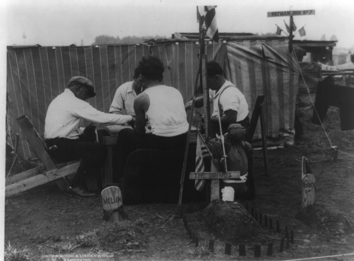
Right: Western Bonus Army lays siege to Capitol, spend night on plaza lawns, 1932.