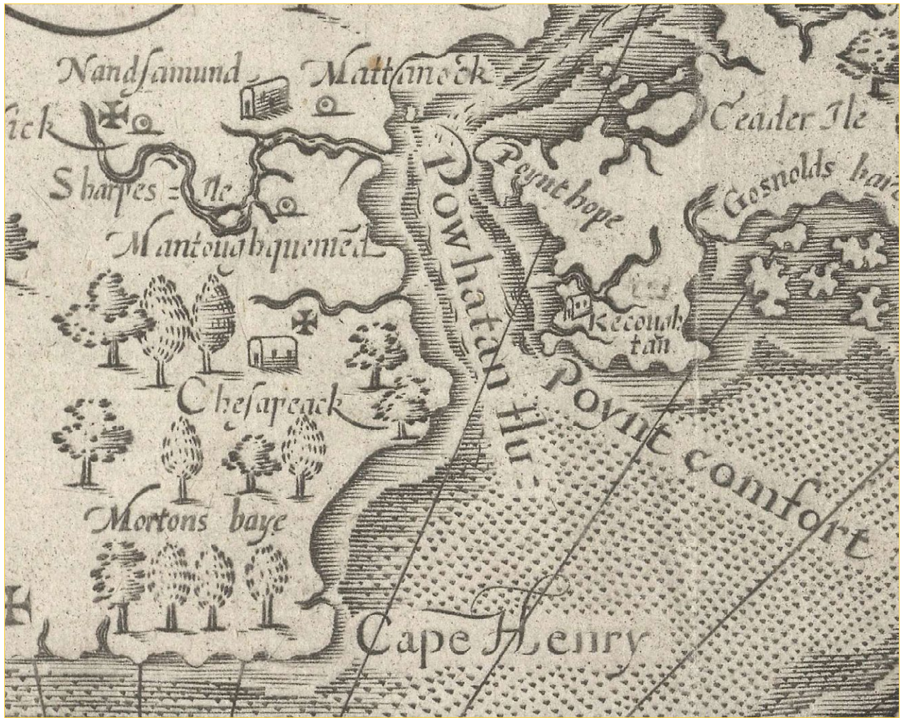
John Smith's map (created in 1608, printed in 1612 and 1624) shows "Poynt comfort," where the first enslaved Africans were brought to Virginia by English privateers.

Slavery Images: A Visual Record of the African Slave Trade and Slave Life in the Early African Diaspora | slaveryimages.org/about/about.php