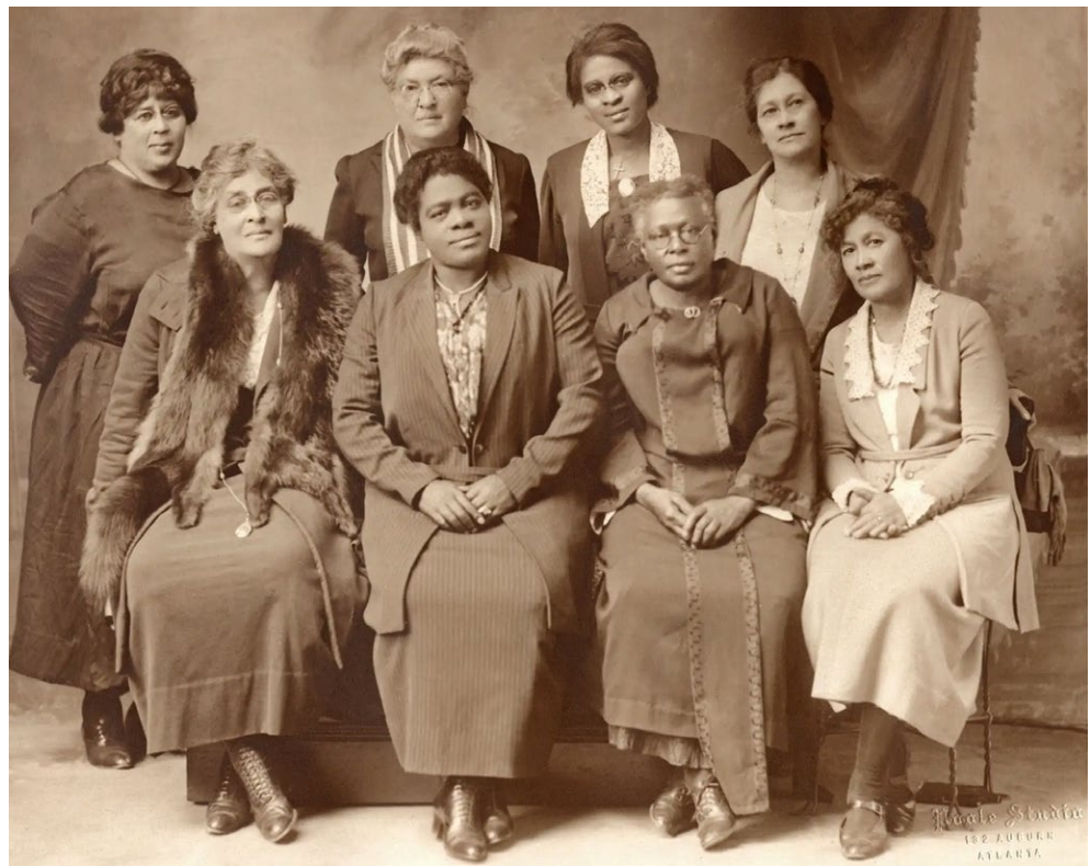
College President Mary McLeod Bethune, Margaret Murray Washington, and the Women of the Southeastern Federation of Colored Women, an affiliate of the National Association of Colored Women, 1921.

Black men and women in America during the Gilded Age and Progressive Era organized to counter the steady erosion of their civil rights through legal and extralegal means. Challenges to the Civil Rights Act of 1875 resulted in a Supreme Court case invalidating the measure. Supreme Court cases, such as Plessy v. Ferguson (1896) and Williams v. Mississippi (1898), transformed Black citizenship in the South, as legally sanctioned segregation and voter disenfranchisement rolled back most of the gains of Reconstruction. Black women's clubs came together to create the National Association of Colored Women to mitigate the effects of racial segregation and discrimination while educating and uplifting Black communities.