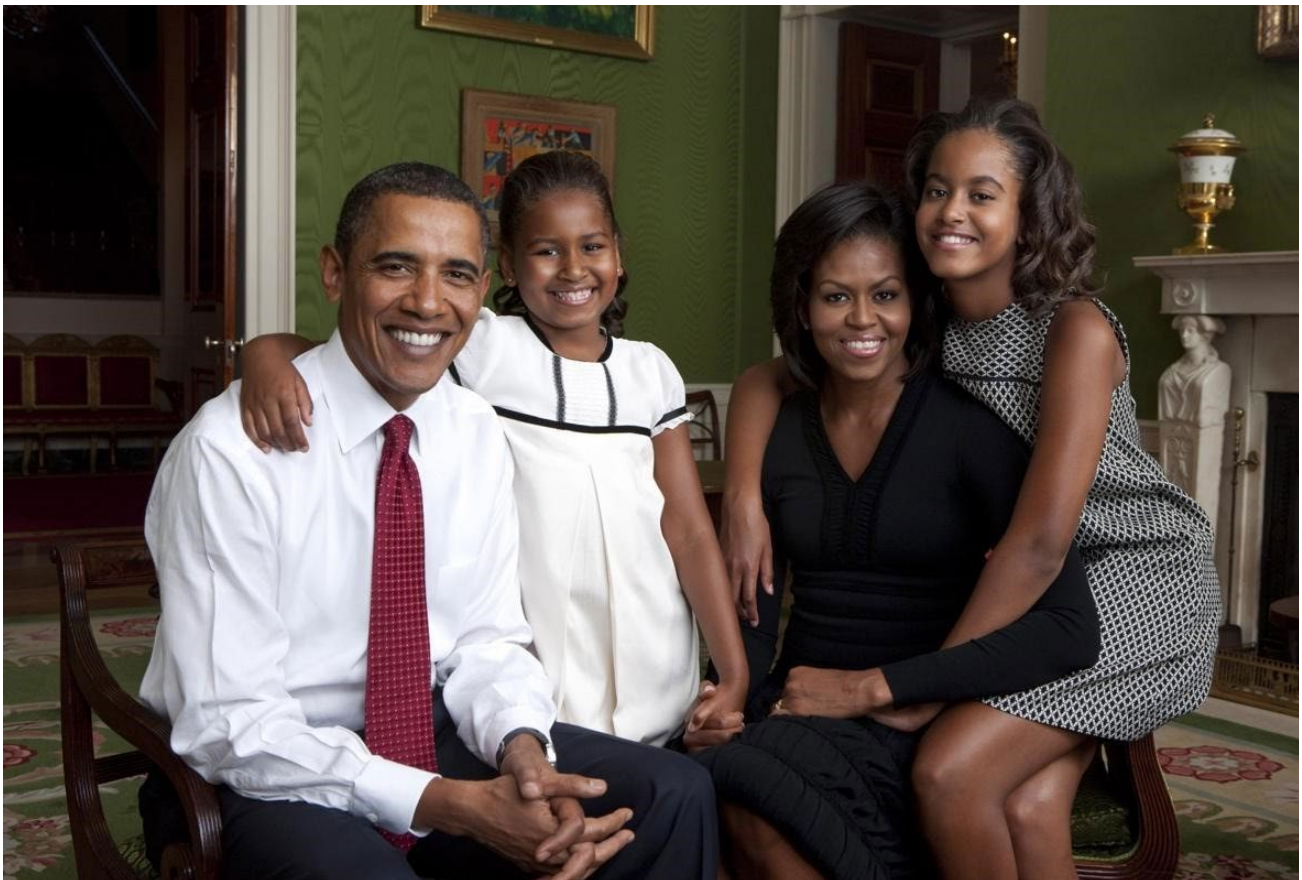
President Barack Obama, First Lady Michelle Obama, and their daughters, Sasha and Malia, sit for a family portrait in the Green Room of the White House, September 1, 2009.

The HistoryMakers is a national nonprofit research and educational institution committed to preserving and making widely accessible the untold personal stories of both well-known and unsung African Americans.