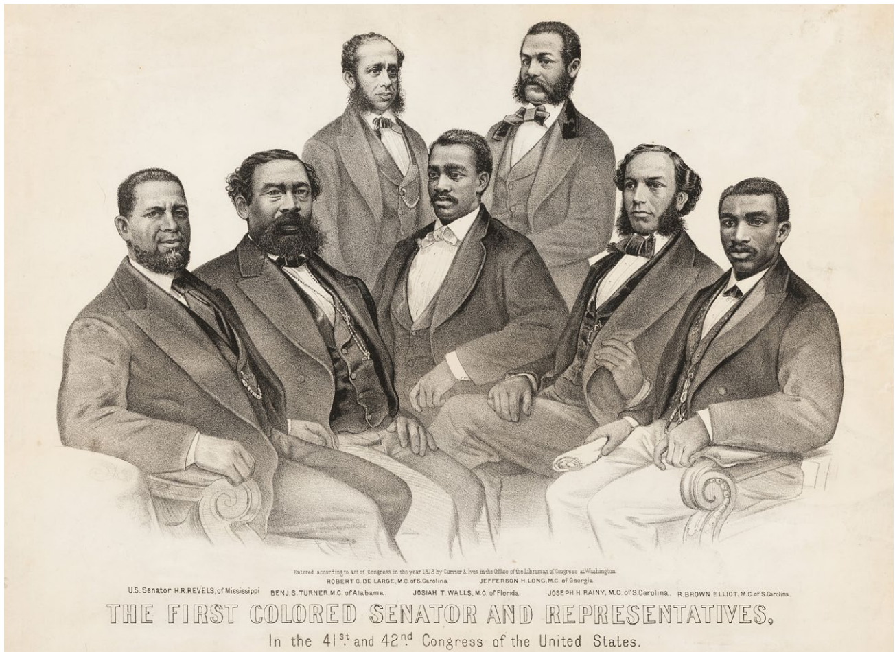
Lithograph of the first African American Senators and Representatives who served in the U.S. Congress, 1872. National Portrait Gallery, Smithsonian Institution (NPG.80.195)