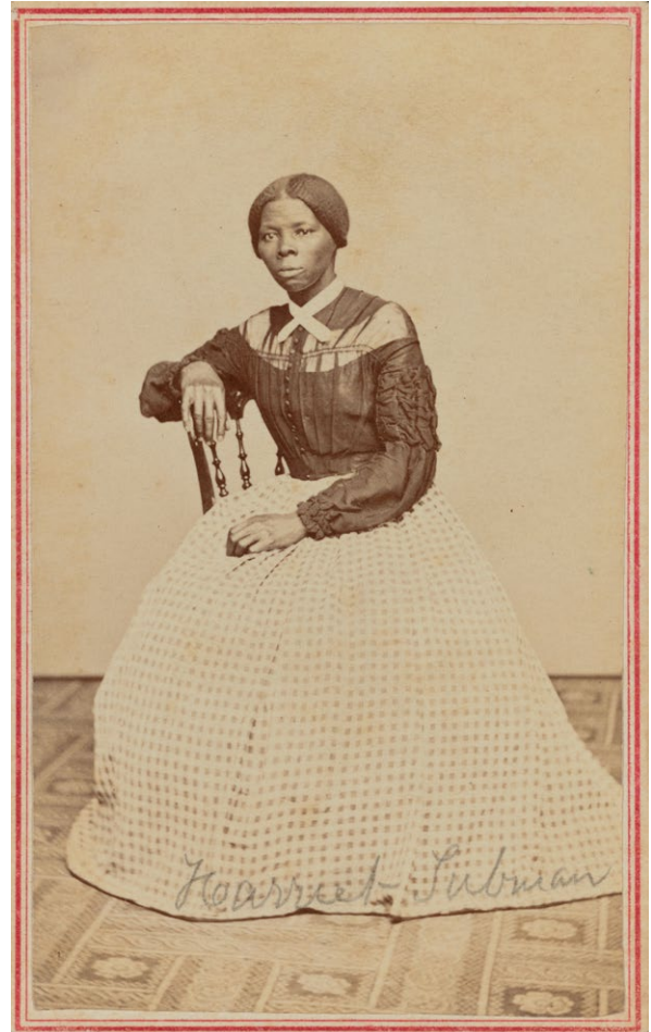
A portrait of anti-slavery activist and abolitionist Harriet Ross Tubman Davis.

From 1830 until well after the Civil War, African Americans gathered across the United States and Canada to participate in political meetings held at the state and national levels. A cornerstone of Black organizing in the nineteenth century, these “Colored Conventions” brought Black men and women together in a decades-long campaign for civil and human rights.